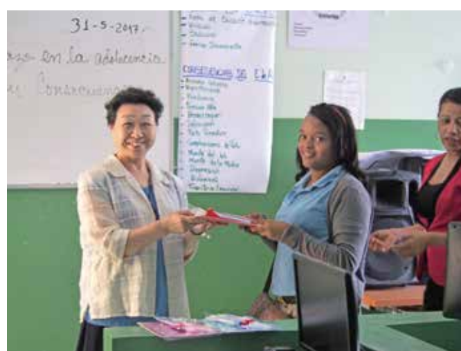
WFPW Volunteer Presented Stationeries to Participants of a Seminar