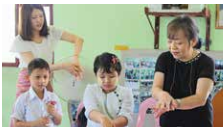
Hand Washing Instruction