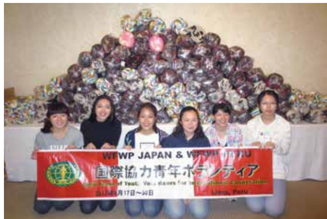
160 Blankets Brought from Japan