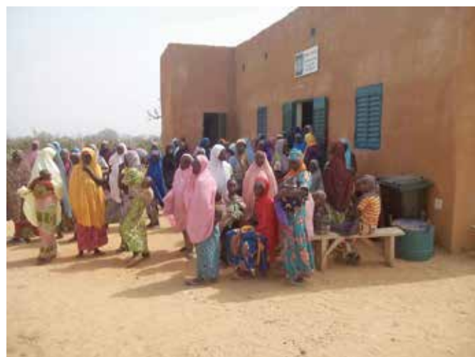
Mothers and Children Visited the Center for Immunization Campaign