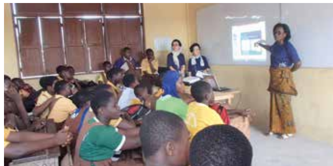
A Class at D L Basic School Opah

From February to December, seminars on AIDS prevention education and family value education were held at 15 schools including Progressive Faith School and Holy Child Academy in Accra, the capital. The total number of participants was 2,013.