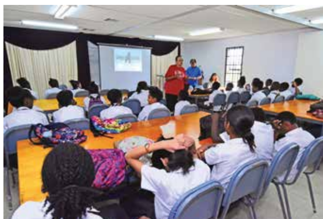
A Class at Maraval Junior High School