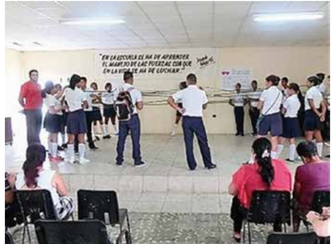
Character Education Workshop at the Las Tunas Teachers' School