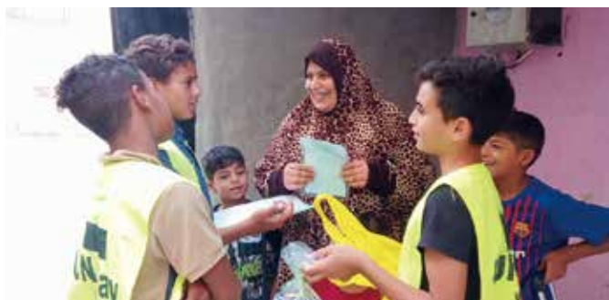
Children Calling for a Cleaning Campaign