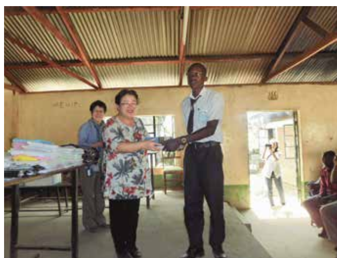
Donation of Materials from Japan