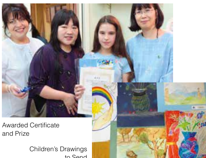
Awarded Certificate and Prize