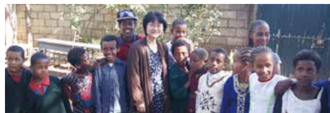
Last Class of Pupils

WFP Japanese volunteers initiated free literacy education in 1997, in Woreda District 10 of Addis Ababa, the capital of Ethiopia, for impoverished school-aged children who cannot afford schooling. In 2001, they started Non-formal Education Child Support Program which was approved by the Ethiopian government. After 3 years of education, these children are admitted to the Addis Ababa Municipal Elementary School as fourth graders. The school offers Amharic, the official language, mathematics, English, social studies, art, music and physical education. The foster parents program has been supporting the tuition for children from poor families since 2003. Reading