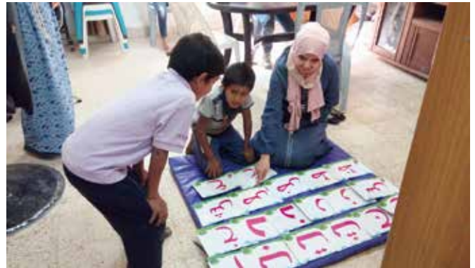
Arabic Class for Children