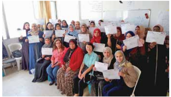
Awarded Workshop Completion Certificate