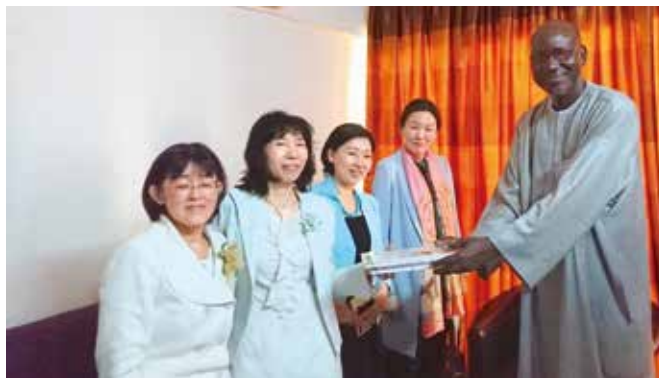
With Vice Minister of the Ministry of Women of Senegal