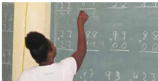
A Scene of a Class