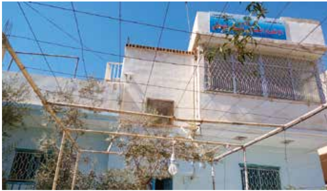
WFP Rusaifa Center