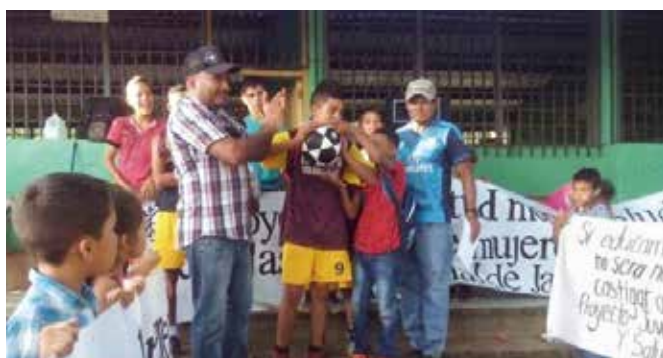
Awarded a football as a Prize

On September 22, WFP's Cup Football Tournament was held. Twelve teams participated. Children from elementary school having football teams in Colonia Reparto. Two hundred and fifty people including the audience gathered. During the tournament, volunteers prepared meals and served children.