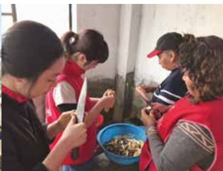
Helped Preparations for Lunch