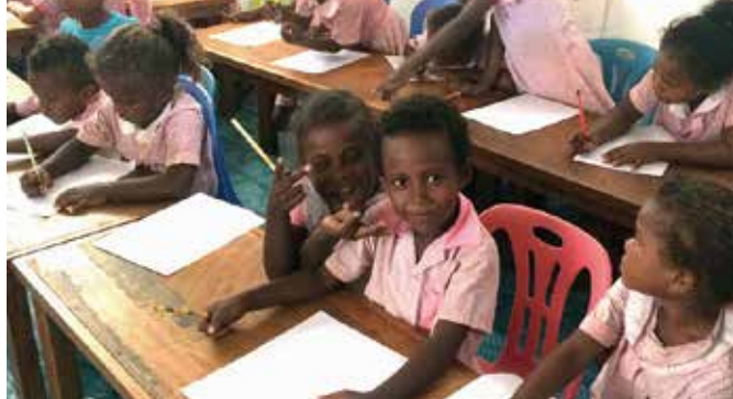
Three year old class