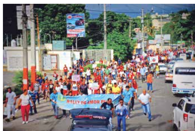
Pure Love Movement March co-organized with Los Alcarrazos City

Other country where WFPW operates AIDS prevention education in the Caribbean: Jamaica