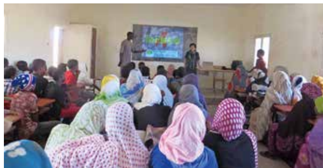
A Class at a Junior High School In Shami City