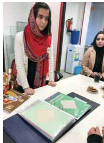
A Students Reoprtng What She Learned