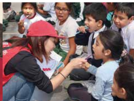
Toothbrushing Instruction at an Elementary School