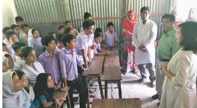
National Singer WFPW Vice President of Bangladesh (then) visited the school