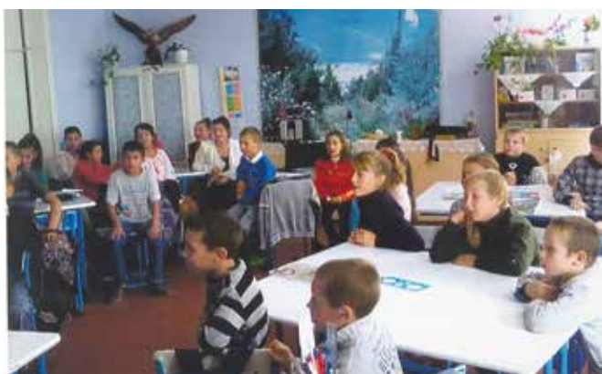
Children of Cazanesti Center

Moreover, every school has children who cannot afford clothing, underwear, educational materials, nor even meals. Some are as deprived as orphans, but cannot enter an orphanage for protection because their parents are alive. Urged by local educators and scholars, in 2001 WFPW established a Childers's Day-Care Center at the Cazanesti public elementary and junior high school in the village of Cazanesti, Telenesti District, in order to help children at compulsory education age (up to 15 years old) from becoming victims. WFPW borrow some classrooms, a play room, and a dining hall of the school for free and use this as the Center. The Center supplies needy children with clothing, underwear and school materials to send them to school, feeds them after school, and provides them with a place to do homework, make handicrafts, sing and play. Thirty children come to the Center daily where six staff members including