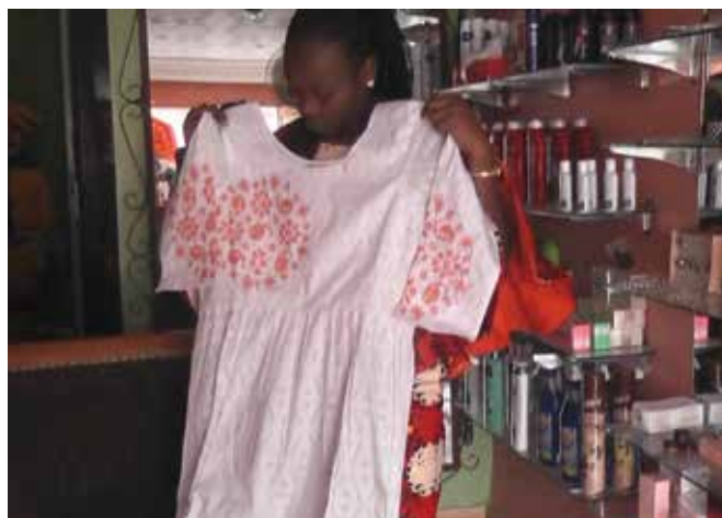
A Graduate who Became Independent with Excellent Embroidery Technology