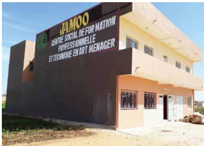
School Building of Newly Constructed the JAMOO II