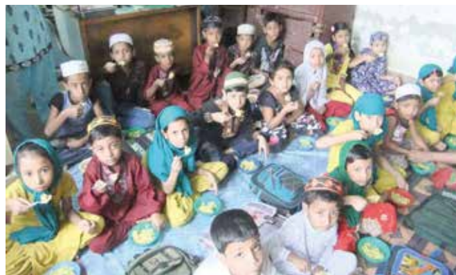
Children who are taking lunch at the Clinic

their family, so it is difficult for them to join regularly. There is also a big difference in the level of their comprehension. At first the class was separated between those who are quick to learn and those who need more time, but since there is only one teacher and this was difficult time-wise, they were put in the same class again. Since it is necessary to go over the same lessons repeatedly for people who have a hard time understanding, they were moving at a slow pace, but the women who understood well gained more confidence and became able to teach the women who had a difficult time.