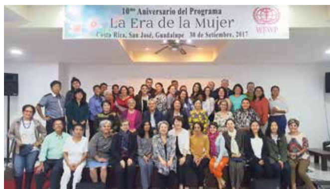
The 10th Anniversary of TV Program "Age of Women"