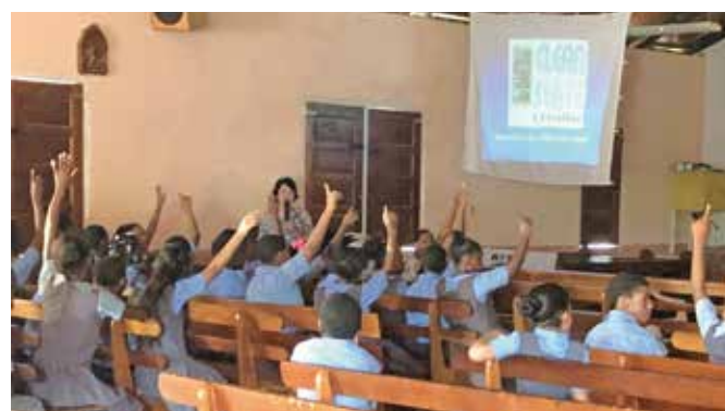
A Seminar at the Saint John Vianney RC School