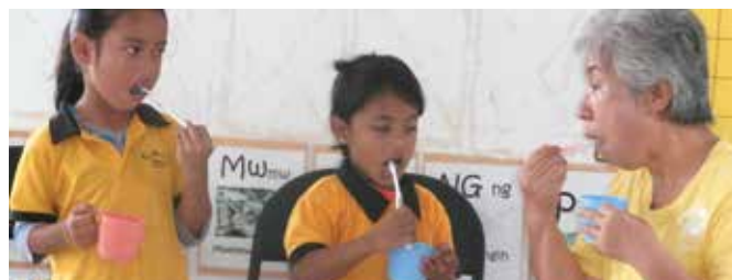
Instructing Toothbrushing at the RSP kindergarten