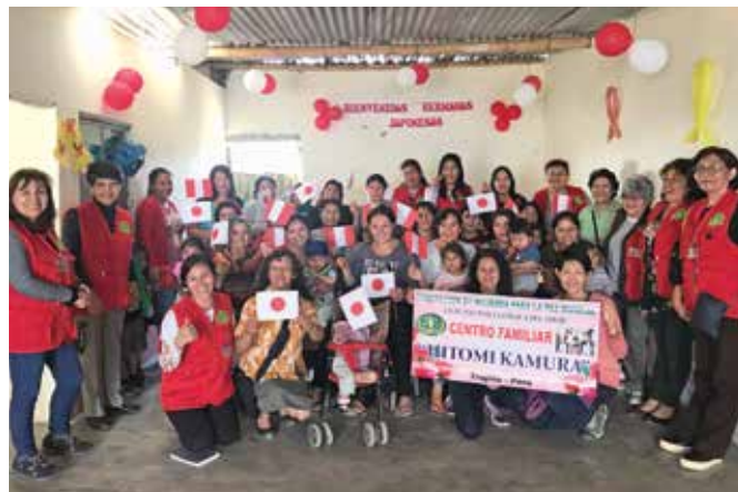
Opening Ceremony of a New Center