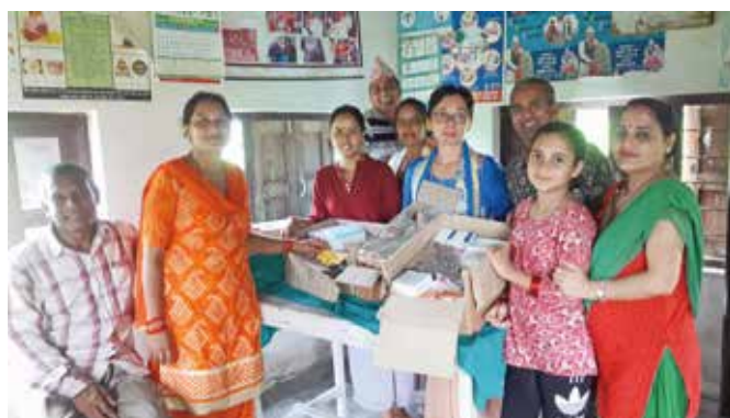
Donation of Medicines for the World Peace Health Service Center