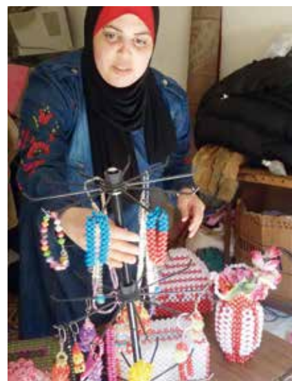
Beaded Fancy Goods Production and Sale