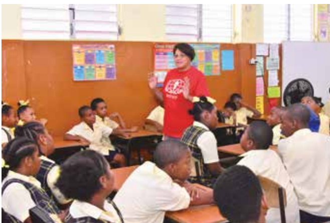
A Class at Tunapuna AC Elementary School