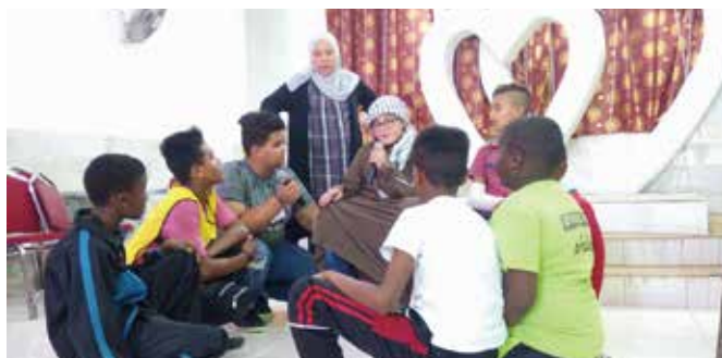
Children Performing a Play at a Refugee Camp