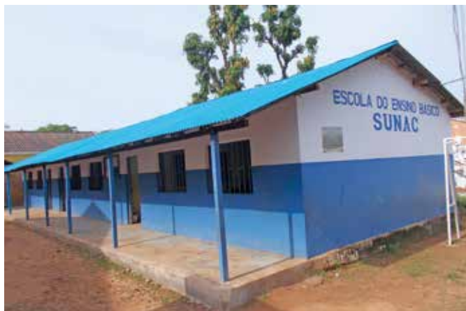
Current School Building

The parents appreciate the fact that while many students who go to public schools tend to miss classes because of teachers' strikes, this school has been able to offer classes regularly throughout the year without any strikes.