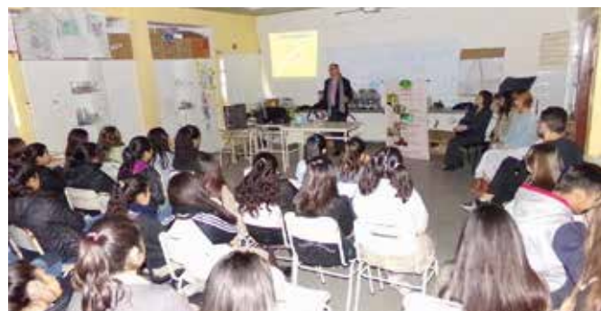
A Class at the No. 5 School of Technology in San Miguel de Tucuman City

Spanish version of "Living in the Era of AIDS" and "Amor puro", textbook on abstinence and self-control, are used as educational materials.