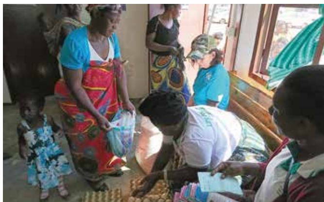
Delivering Soy Powders and Eggs