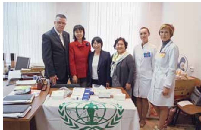
Donation of Medical Materials

WFWP established a Health Education Center in a school in which primary and secondary education are combined in the