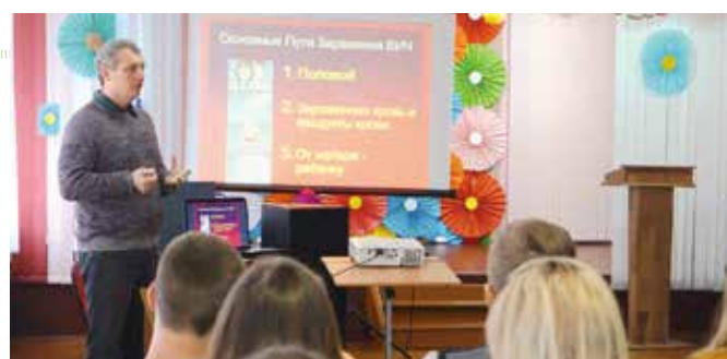
A Seminar at the 2nd Chchersk School