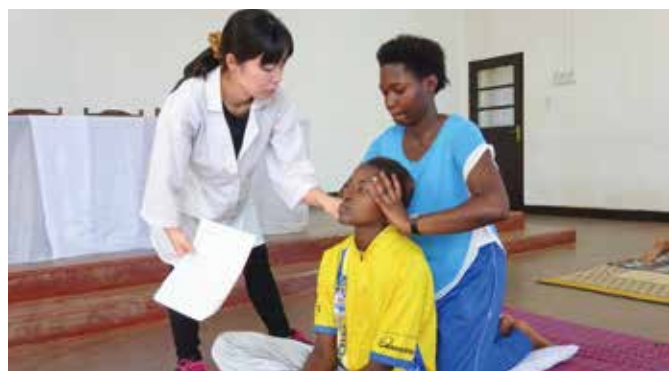
Instruction of Massage