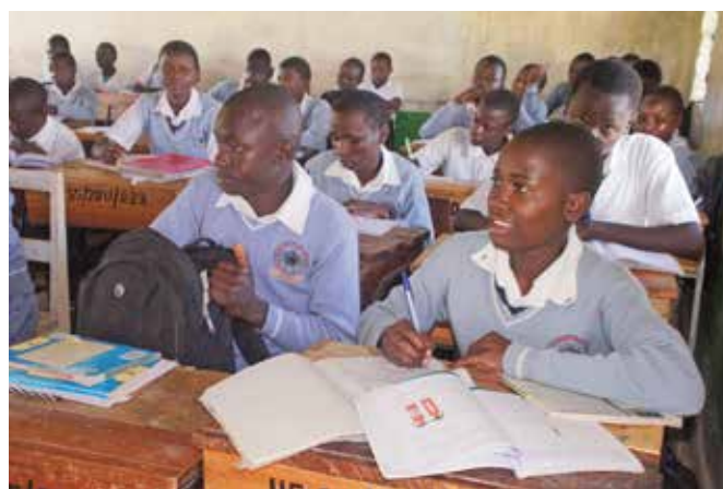
A Scene of a Class