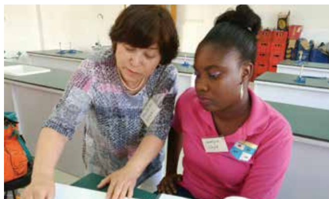
Teaching at the Dominica State College