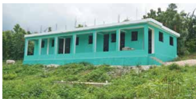
Newly Constructed School Building