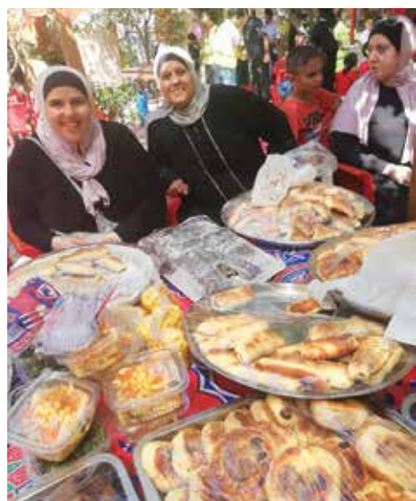
Bread Production and Sale