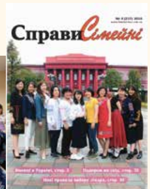
Team Became a Cover of a Ukrainian Magazine