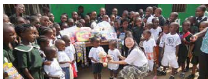
Donation of Materials from Japan