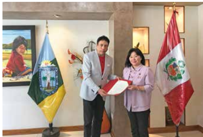
Letter of Appreciation for Donation of Blankets from Mayor of Chosica