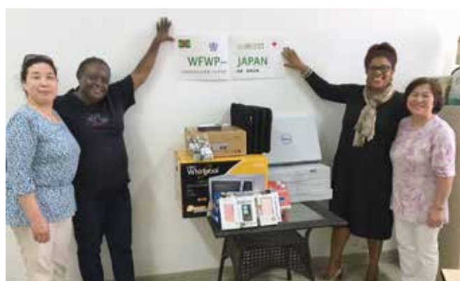
Donation of Relief Aid Materials to the Dominica State College