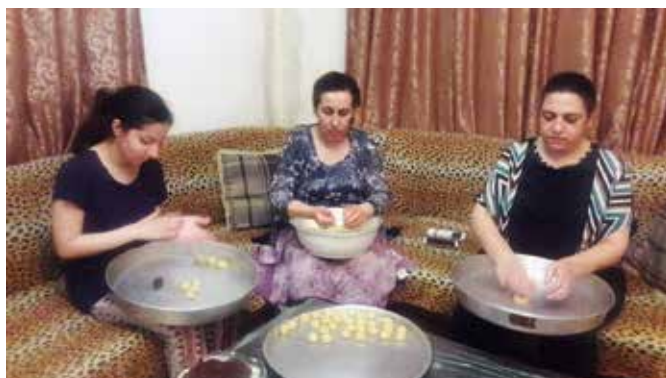
Traditional Confectionery Production and Sale