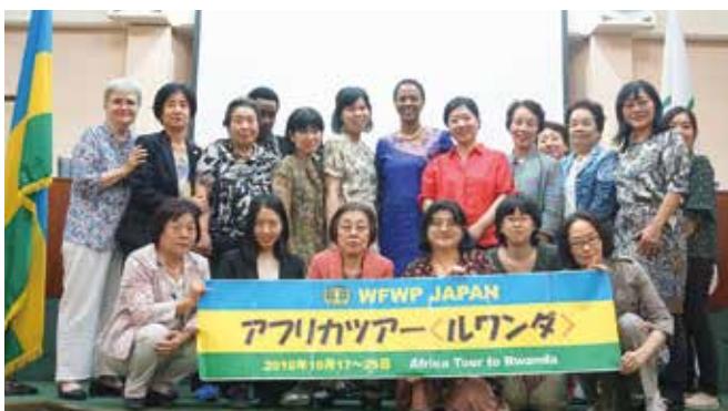
With Vice-President of the Rwandan Senate