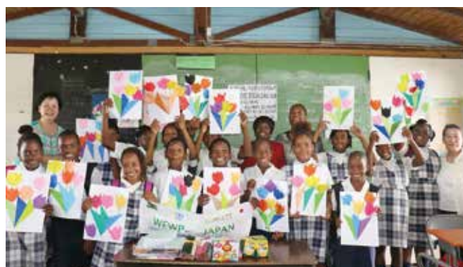
Art Class at an Elementary School