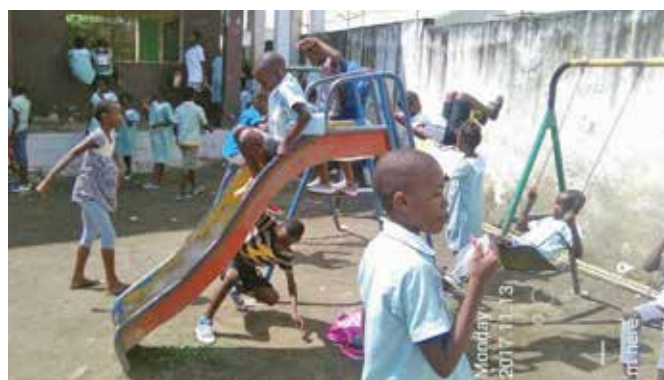
Children Playing with Playground Equipments