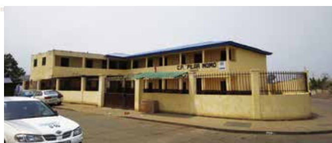
Current School Building

WFPW Japan will be supporting the construction of school