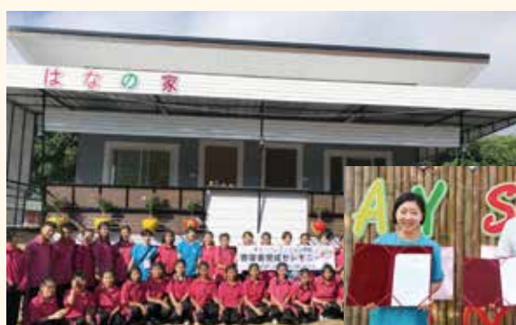
Opening Ceremony of a Dormitory, "Hana House"