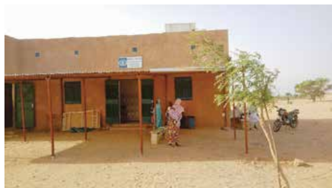
Newly Set Up Waiting Area