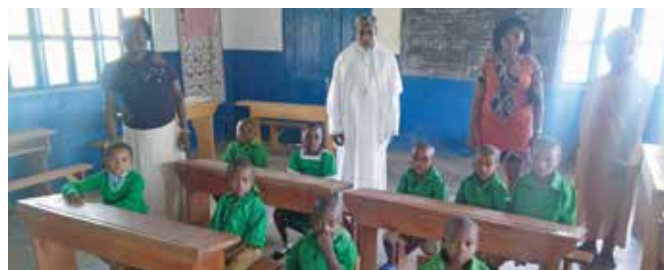
Teachers and Pupils

Requested by the community, the Sun Luna Elementary School was opened in September 2015.