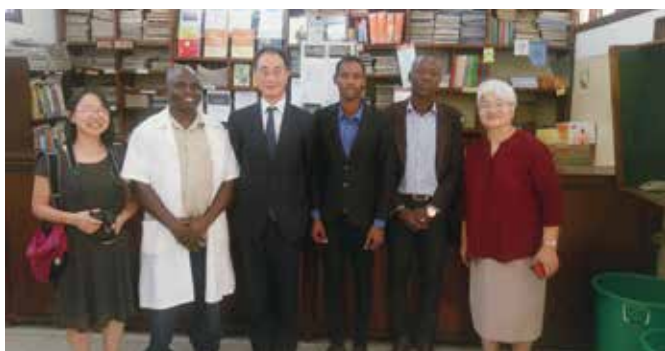
In 2018, Ambassador of Japan to Mozambique (third from left in photo) Visited the School. At Library.