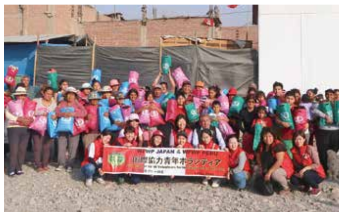
Donated Blankets to Each Flood Victim in Chosica