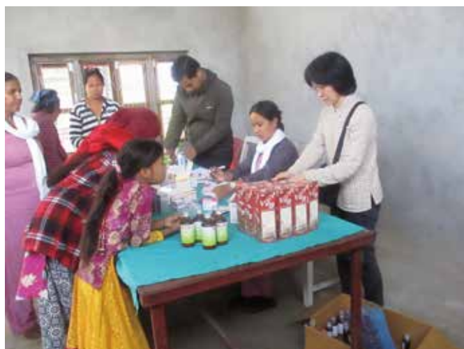
Distribution of Medicines