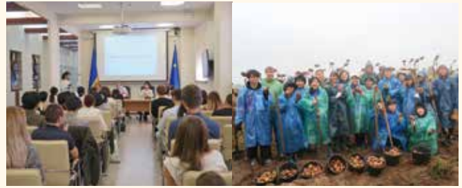
Symposium with Students of Kiev University Experience of Harvest at a Farm