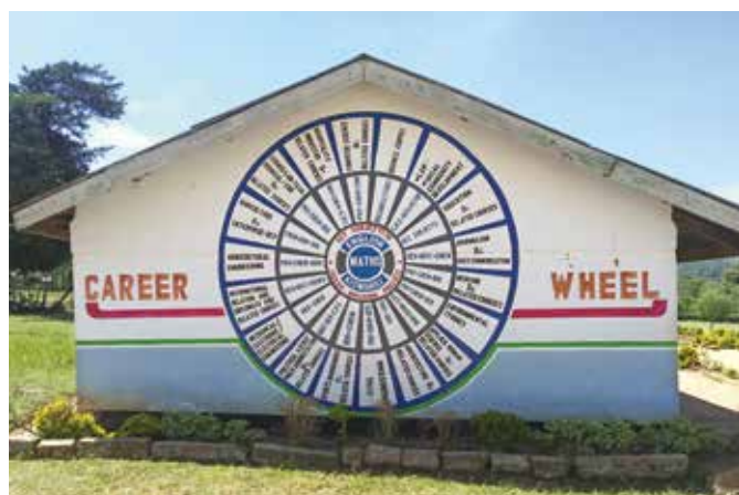
Teaching Future Career Choices with a Talking Wall