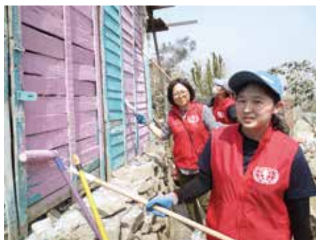
Mother and Her Daughter Painted Walls