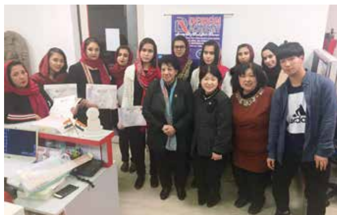
With Students who Completed Sewing Course