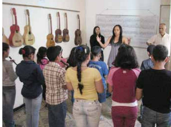
A Class of Recorder