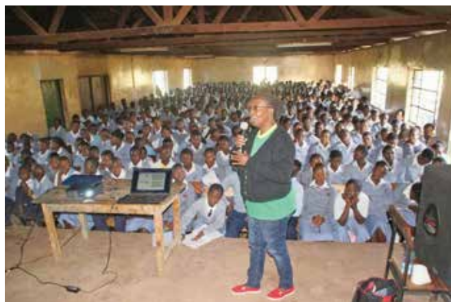
A Seminar at the Handow Junior and Senior High School

From January 9 to 10, AIDS prevention seminar was held at Handow Junior and Senior High School. On the first day, a lecturer gave a lecture of "Living in the Era of AIDS" and 300 students who were mainly 3rd and 4th graders attended. In addition, for 45 members of PTA, lectures on family values and importance of moral education was given in Swahili. On the second day, a lecture of character education was held for 300 students. In the questionnaire after the seminar, there were many students who took the contents of the lecture seriously, but it was found that some students were anxious that they were infected with HIV/AIDS.