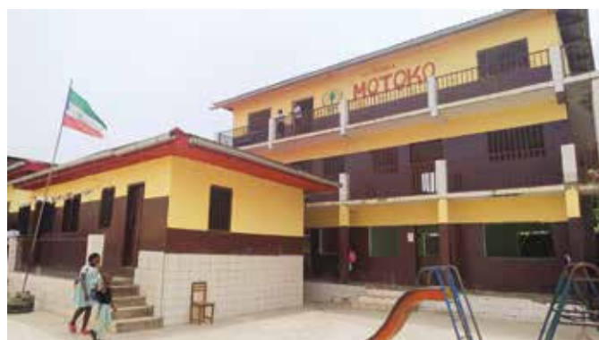
Current School Building