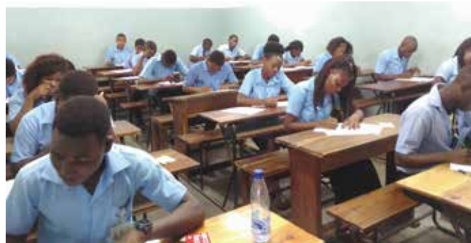
Graduation Examination of 12th Graders