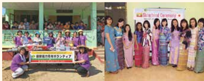
Gifts for Opening Ceremony of the School