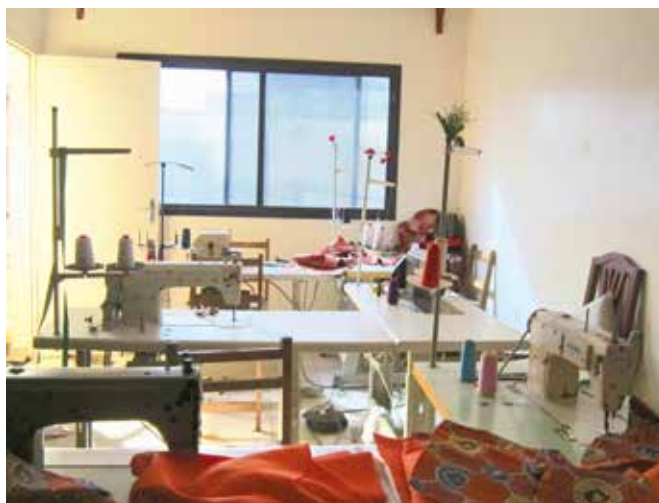
Inside of Training Shop