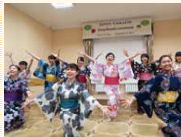
Performed Dance in Colorful Yukata