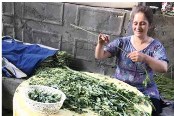
Sale of Vegetables